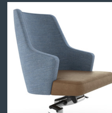
Conference Chair: Contrast Fabric on Seat & Back