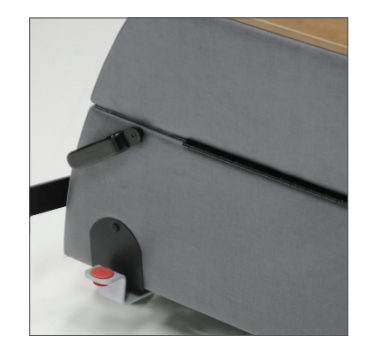
Central locking system

An arm panel that can be folded to provide barrier free access to the patient from either side of the chair.