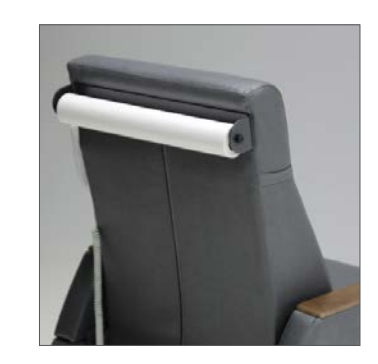
Paper Roll holder

The heated seat and lumbar provides therapeutic warmth and eliminates the need of warming blankets. The optional massaging action provides three variations: wave, pulsating, and vibrating.