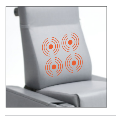
Heated seat and lumbar

All wheel locking system with 3" double wheel Tente Casters